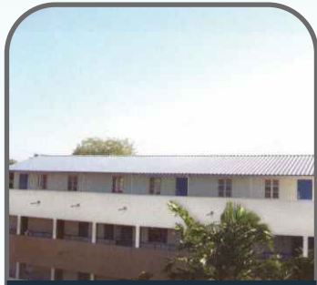
Roof Top Rooms