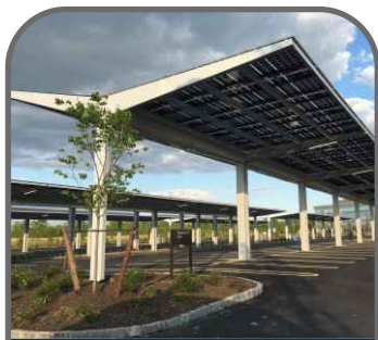
Car Parking Shed