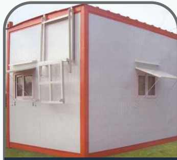
Site Bunk House